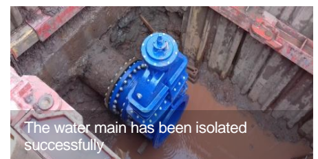
The water main has been isolated successfully

However we recommend that walkers without suitable footwear use our Black Oak Road diversion, which is clearly