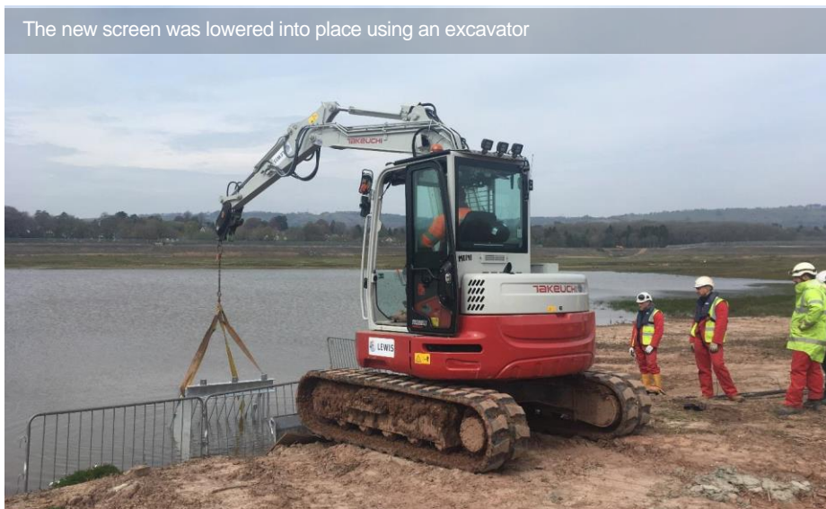
The new screen was lowered into place using an excavator