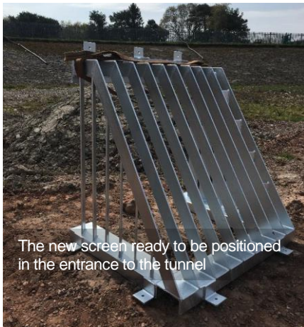
The new screen ready to be positioned in the entrance to the tunnel