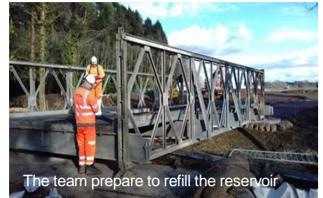
The team prepare to refill the reservoir

This work is taking longer than we anticipated, as we needed to isolate an important live water main supplying water to thousands of customers in Cardiff.