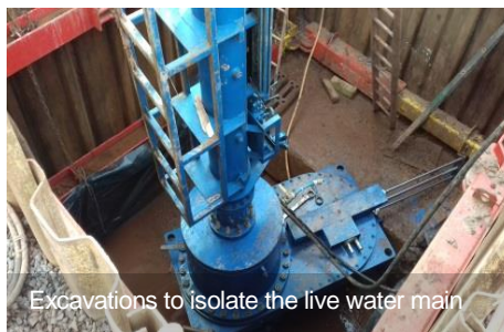
Excavations to isolate the live water main

We are laying a new water pipe along the eastern side of Llanishen reservoir, which will help to improve the resilience of the water supply to our customers in Cardiff for years to come.