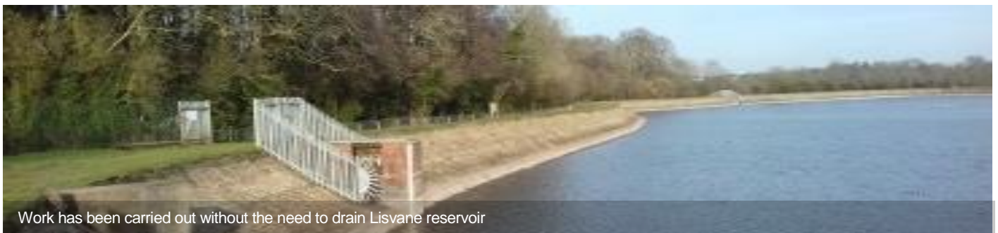
Work has been carried out without the need to drain Lisvane reservoir