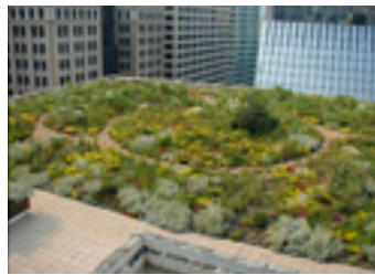
Green your roof