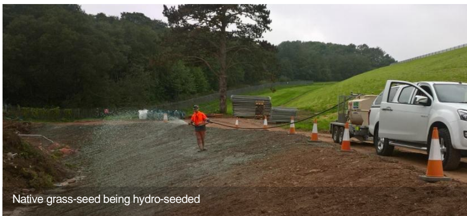
Native grass-seed being hydro-seeded