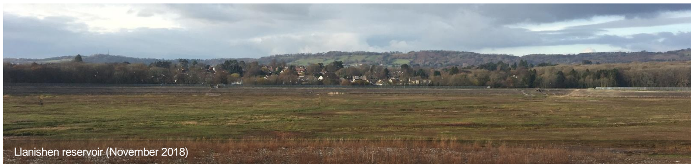
Llanishen reservoir (November 2018)

However we recommend that walkers without suitable footwear, or those wishing to use the through route to Rhyd-y-Blewyn farmhouse, use our Black Oak Road diversion, which is clearly signposted locally.