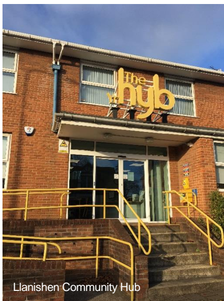
Llanishen Community Hub