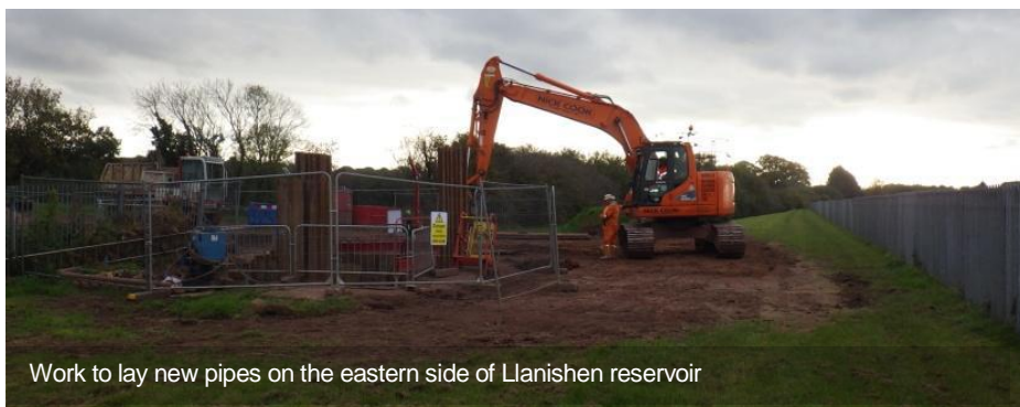
Work to lay new pipes on the eastern side of Llanishen reservoir

The refill process can take up to two years, which is why we have carried out the basin works first. While the reservoir refills, we will continue with our work above ground.