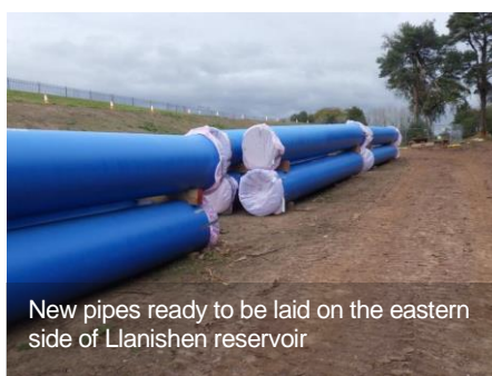
New pipes ready to be laid on the eastern side of Llanishen reservoir

This work is taking longer than we anticipated, as the existing pipes are in poor condition, but we hope to complete the work by the end of February 2019.