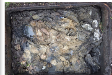
Picture of wet wipes pulled from underneath Welsh Street which is just one of 2,000 blockages Welsh Water deal with per month.

It is not clear who has been flushing wet wipes down the toilet, but Mrs Pritchard and Dylan Williams are continuing to question neighbours and educate them on the importance of only flushing the 3 P's.